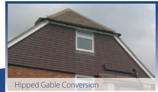
Hipped Gable Conversion

If you are considering making your home more spacious by having your loft converted, please don't hesitate to contact us. We are available any time and will be more than happy to provide you with more details or answer any queries you may have.