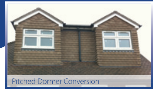
Pitched Dormer Conversion